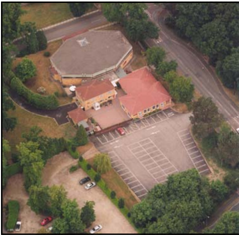
Aerial view of St. Swithun's Centre & Car Park